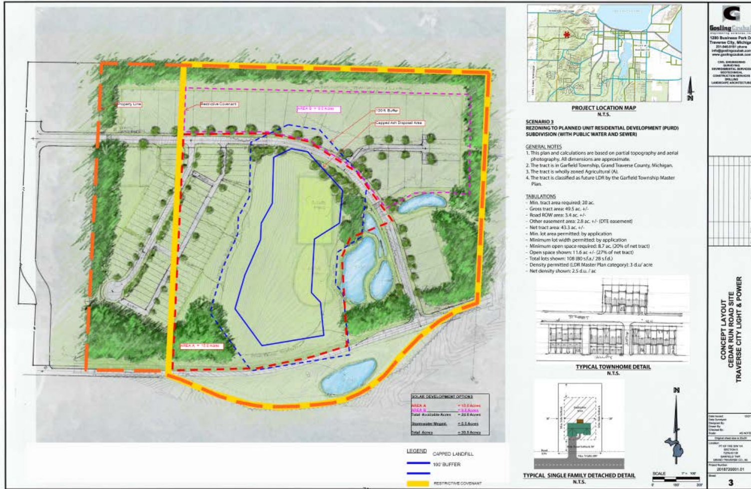
EXHIBIT A - Conception Layout